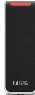
HID-20-IR MULLION MOUNT READER

HID is set to revolutionise the global landscape as the leading provider of Mobile Wallet credentials for Apple iOS and Android smartphones and wearables. By partnering with HID, Inner Range is poised to deliver a seamless, integrated experience, connecting Mobile Wallet Credentials effortlessly with our broadly integrated Access Control solutions. This collaboration ensures that our customers enjoy the convenience that HID and Inner Range can deliver to meet the complex demands of these applications. Future proof your site by deploying the Inner Range Hybrid Signo SIFER Reader technology to ensure that all HID formats, the Inner Range SIFER-P format, and Mobile Wallet Credentials by iOS and Android are all allowed for in a single RFID Reader.